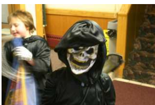
Above are Pictures of a few Trick or Treaters from 2008.